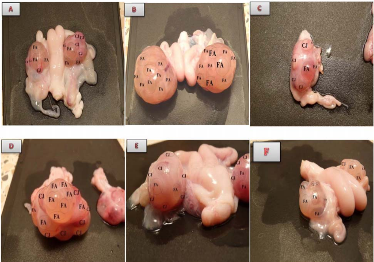
Figure 3: Ewes' ovary in T2*.

T1*(PMSG 1000IU); CL (Corpora Lutea); AF (Anovulatory Follicles); A, B and C (superovulated ewes).