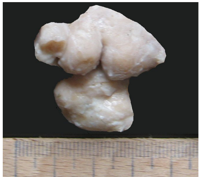
Fig. 5. Popliteal lymph node