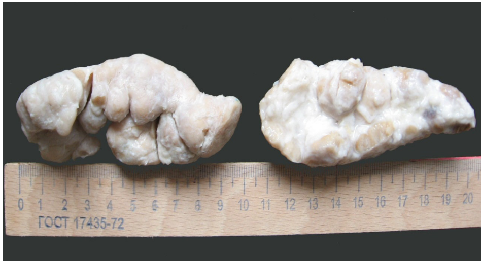
Fig. 3. Cervical superficial lymph node

the length of 7 cm to 4 cm in width [Fig. 6].