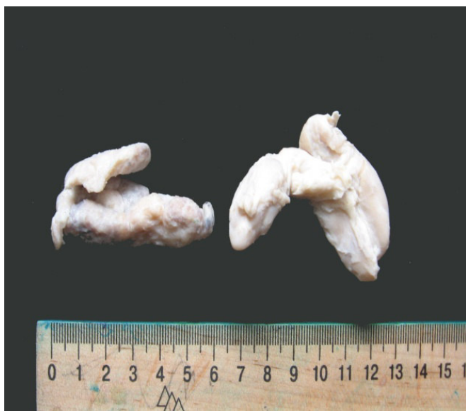
Fig. 1. Parotid lymph node

Among somatic lymph nodes examined; we have the parotid lymph node; is constant and unique. There is flattened on one side to the other and measure an average of 3 cm in length by 1 cm wide [Fig. 1]. We have also observed the Submandibular lymph node is located in the caudal angle of the mandible laterally to the region of the throat, cervico-facial under the platysma muscle. It is related to the ventral extremity of the