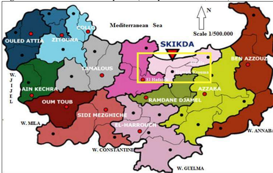
Fig.1: Presentation of the study area (Wilaya de Skikda, 2008)