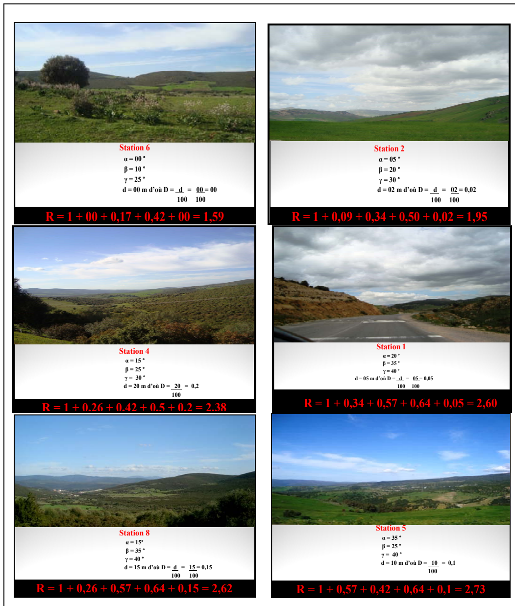
Fig. 2: Impact of vertical dimensions

may notice an uneven landscape due to the different terrains offering a viewer an open field from a highest point of view. The viewer is both dominant and dominated by a landscaped portion, the vertical dimensions (R) has the highest value (Fig.2).