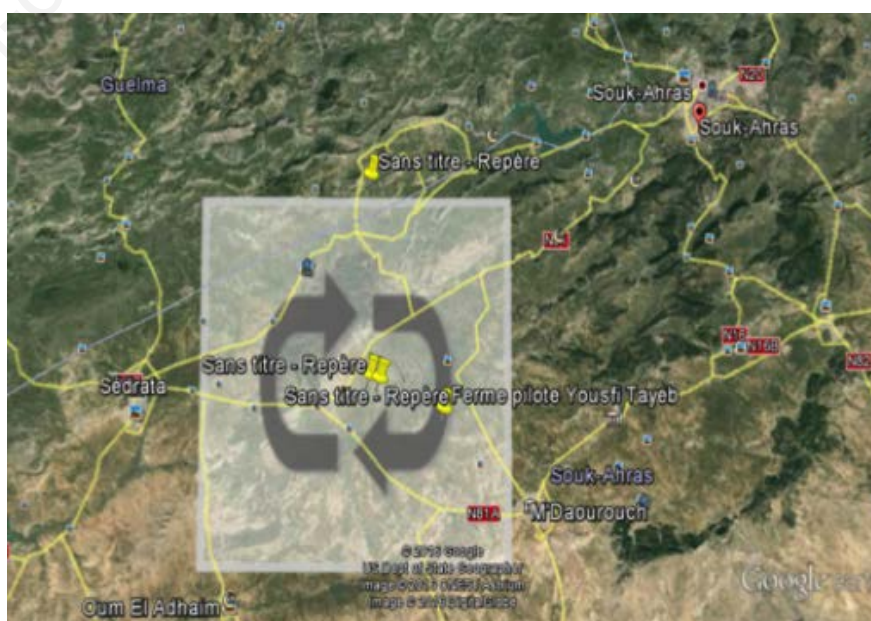
Figure 1. Satellite image of the experimental site: Youfsi Tayeb pilot farm, Algeria.

Averages with the same letter are not very different. Alpha: 0.05; Error Degrees of liberty: 2; Middle Square Error: 0.540357; Critical value of t: 4.30265; Smallest significant difference: 1.1954.